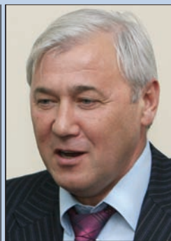
Anatoly Aksakov, State Duma deputy, member of the National Banking Council

November, when there was a steep rise of repo operations. It is calmer now as the central bank reacted to the situation on external markets. Interest rates are rising, obviously. One of the reasons is the growing price of loans abroad. Many cannot afford them any longer. As a result, banks are forced to raise their rates too. And the long term resources of Russian credit organisations are not that strong. They turn to the West, but the prices of loans have risen, and the banks have to raise the price of their loans. Also, cross-border securitisation had been very active in past years. Now it has come to a standstill due to the reasons just mentioned.