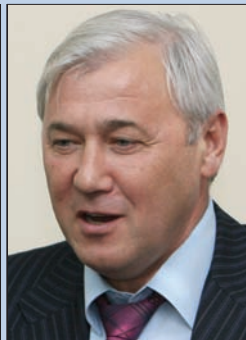
Anatoly Aksakov , State Duma deputy, member of National Banking Council of Russia